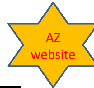
List of Schools and CTDS - County Code, Type Code, and District Code & Site Number